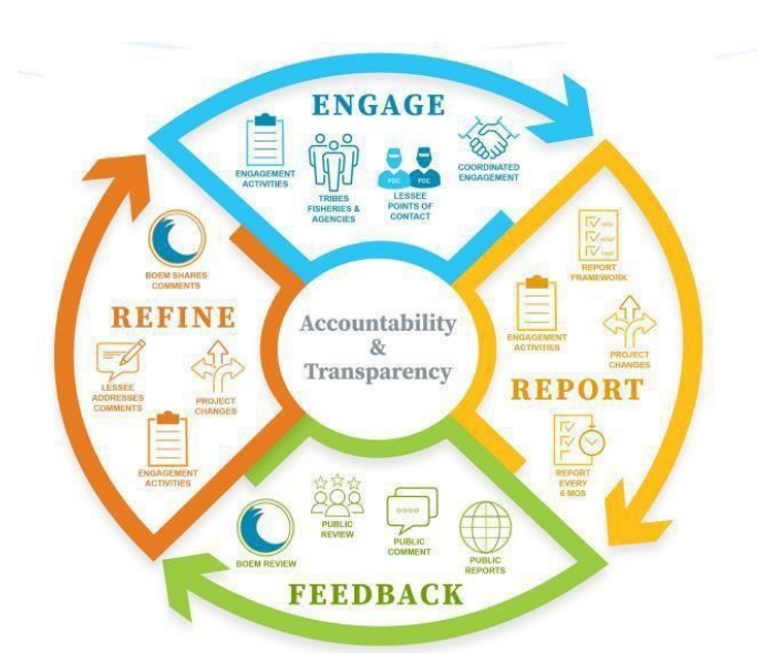
Figure 3. BOEM Stakeholder Communication Approach

Development of the Project within the Lease Area and along the export cable route(s) will occur in several phases including surveys and assessments, design and siting, permitting, construction, operations and maintenance, and decommissioning. The 'adaptive' nature of the FCP will allow it to be updated over time as inputs are received and through different phases of Project development and implementation.