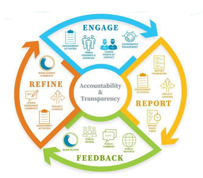
Figure 3. BOEM Stakeholder Communication Approach

Development of the Project within the Lease Area and along the export cable route(s) will occur in several phases including surveys and assessments, design and siting, permitting, construction, operations and maintenance, and decommissioning. The 'adaptive' nature of the FCP will allow it to be updated over time as inputs are received and through different phases of Project development and implementation.