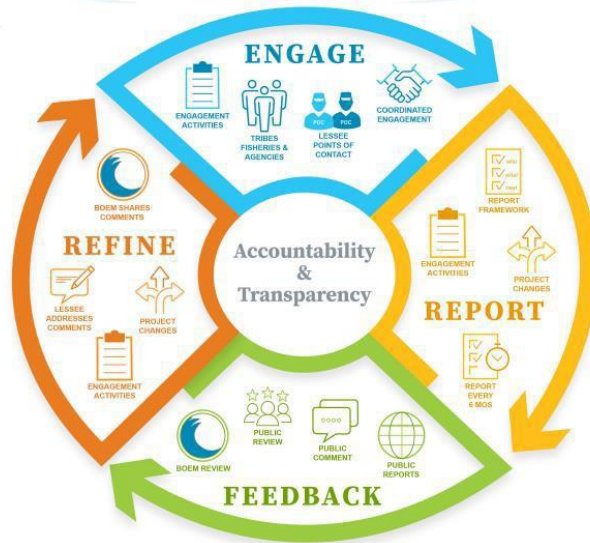
Figure 3. BOEM Stakeholder Communication Approach

Development of the Project within the Lease Area and along the export cable route(s) will occur in several phases including surveys and assessments, design and siting, permitting, construction, operations and maintenance, and decommissioning. The 'adaptive' nature of the FCP will allow it to be updated over time as inputs are received and through different phases of Project development and implementation.